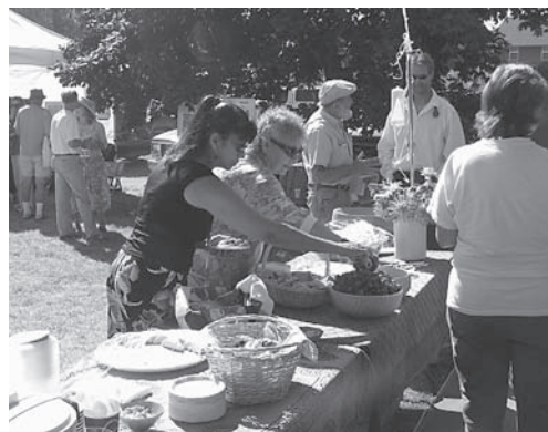
Refreshments, especially the Clinic's famous scones, are always popular at the Health and Wellness Fair.

A fter a break last year, the Health and Wellness Fair returns to the Lopez Medical Clinic this year on Saturday, September 6 from 9 a.m. to 12 p.m. Clinic staff and representatives from a variety of local organizations are preparing for a full morning of activities and services to promote health.